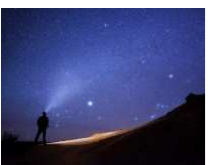
WASATCH GONE WILD

Last weekend, tie-dye clouds covered the premise of the Sri Sri Radha Krish... fc