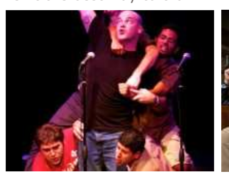
POETS COMPETE AT SLC SLAM FOR NATIONALS SPOT