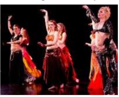
'TIMELINE' SHOWCASES HISTORY

After a much-deserved weekend of celebration following their victory at