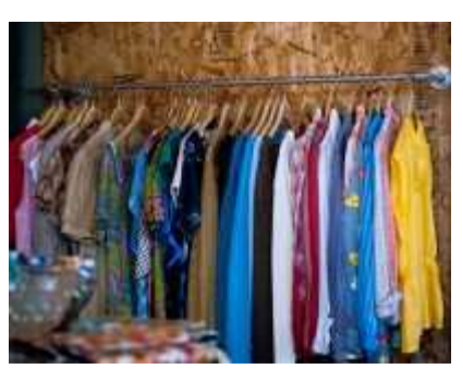
PURVEYORS OF THE ODDLY BEAUTIFUL